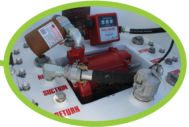
Tank Manway Recessed Spill Box Area *20 GPM Pump Shown