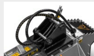
Customized attachment bracket