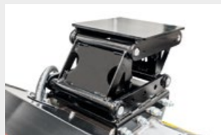
Attachment plate for excavators