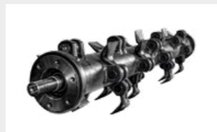
Possibility to have the rotor equipped with PML hammers or Y-flail