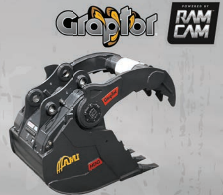
INTERGRATED THUMB BUCKET