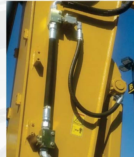
TYPICAL INSTALLATION DIAGRAM : Stick Line Shut Off Valve