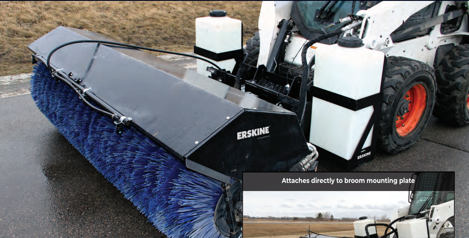
Attaches directly to broom mounting plate