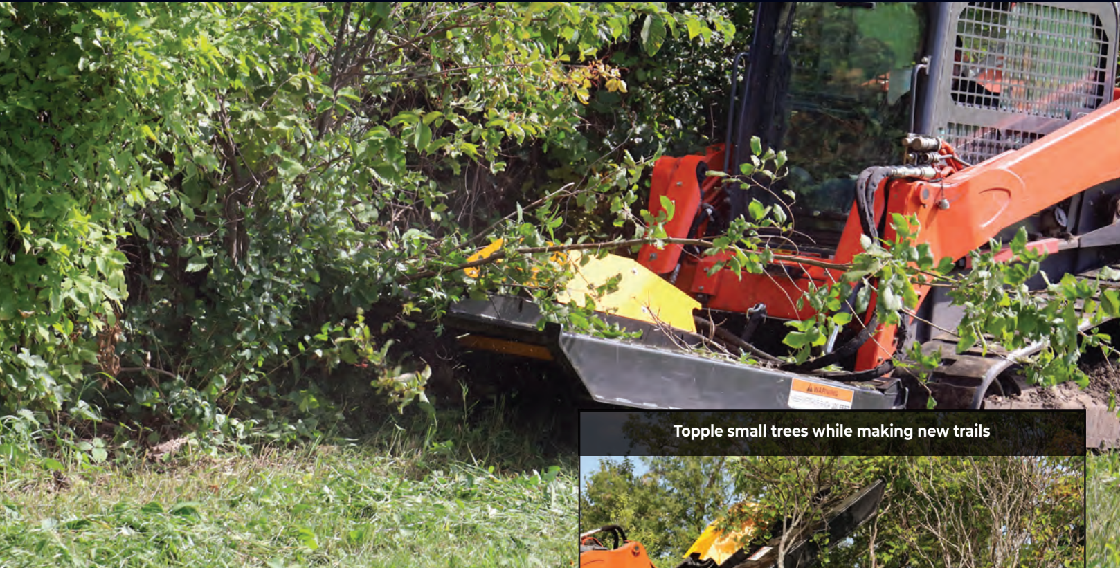
Topple small trees while making new trails